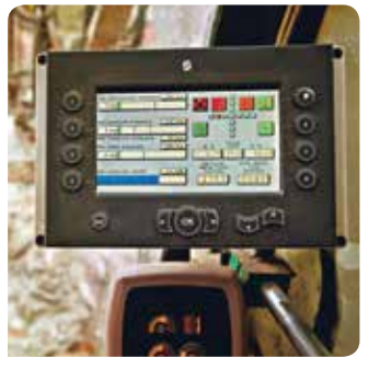
The graphic display of ExcaDrill is user-friendly. The angle and depth measuring system is included. ExcaDrill can be also equipped with a video monitoring camera. This allows the remote visual control of the drilling process on graphic display.